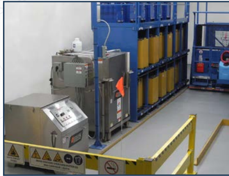
RNS-4 & BWC-2