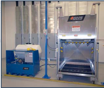
RNS-1 & BWC-2

Use a Recirculation/Neutralization System (RNS) in conjunction with your Battery Wash Equipment in order to create a closed loop system where battery wash water is contained, neutralized, and recirculated for reuse by the battery wash equipment.