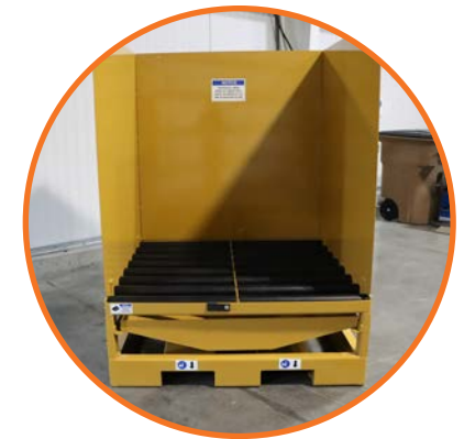
RWS-3 with Fork Pocket option