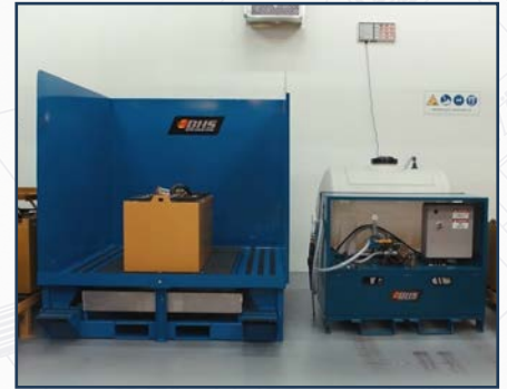
MWS-72 & RNS-1